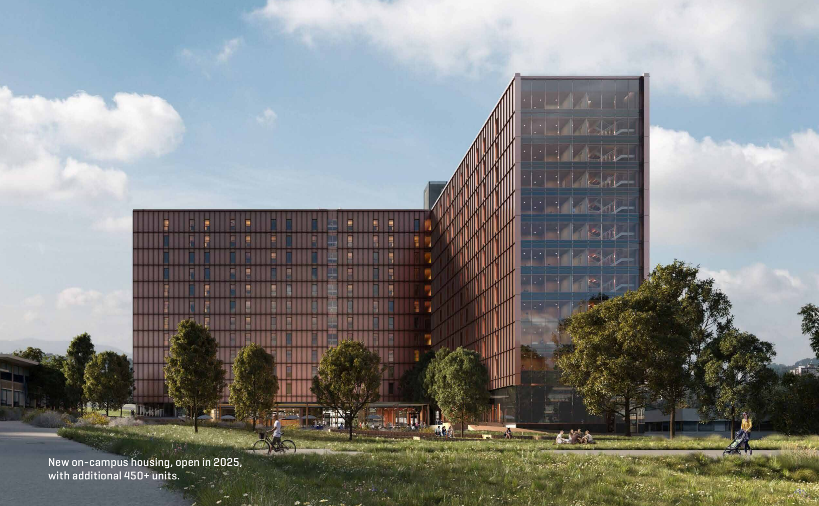
New on-campus housing, open in 2025, with additional 450+ units.