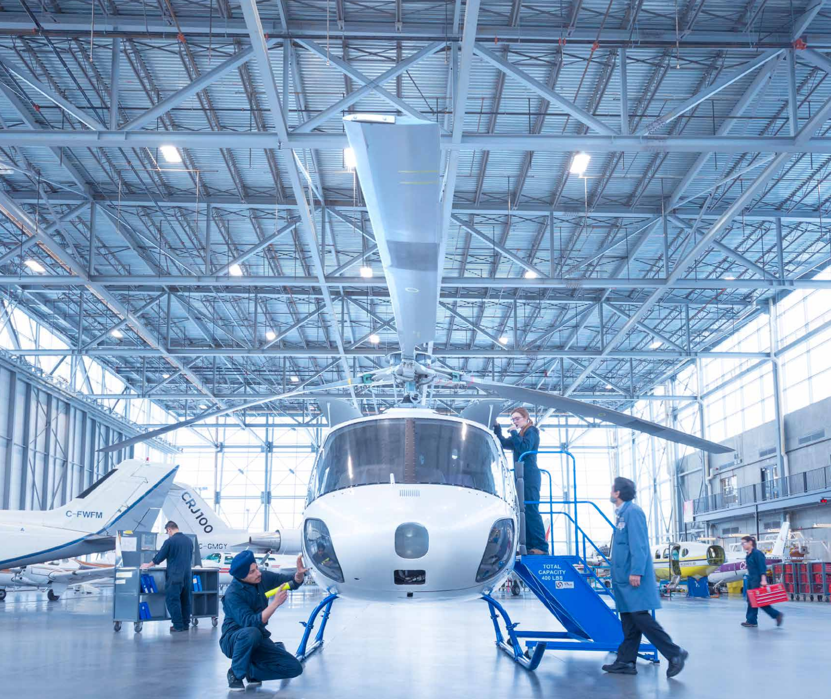
Aircraft maintenance students at the BCIT Aerospace Technology Campus.